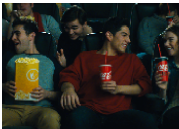
The Library , Ithaca College