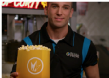
Coca-Cola Gaze , AFI