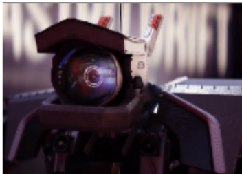
Crunch Time , Chapman