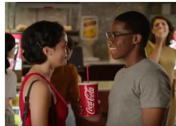
Blindfold , SVA